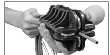
Continue Feeding Tubing Through Working Back & Forth 2- 3x Until Entire Coil is Straight