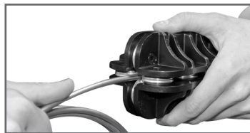
Feed Tubing Through Center Rollers Until It Appears on the Other side