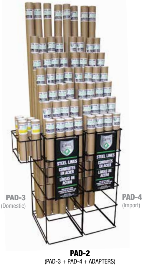
PAD-2 (PAD-3 + PAD-4 + ADAPTERS)

Requires 27" Width x 18" Depth x 63" Height to store all lines.